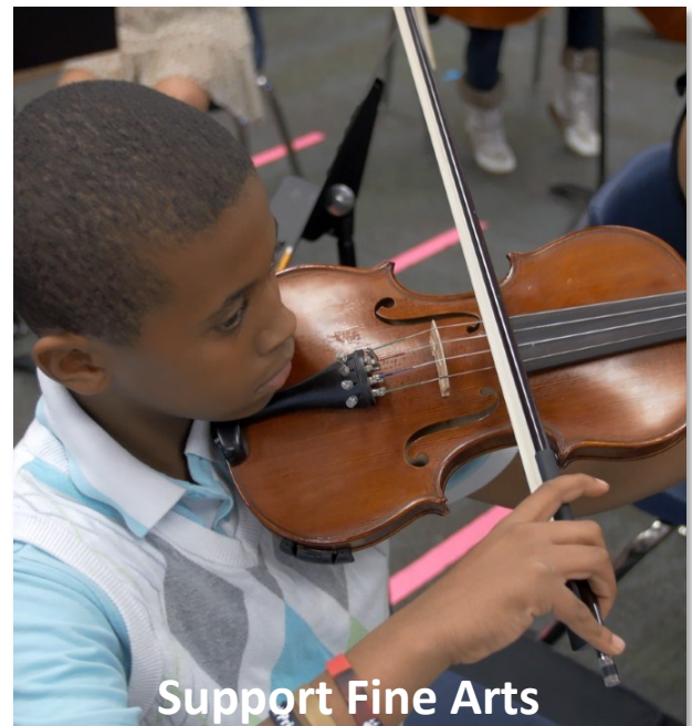
Support Fine Arts

Non-refundable donations are eligible for the Arizona State Income Tax Credit as allowed by ARS §43-1089.01. Please consult with your personal tax preparer to determine the application of this credit. Donations must be received by April 17, 2023 to be eligible for a 2022 Tax Credit.